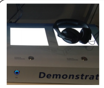
LED Light Pads