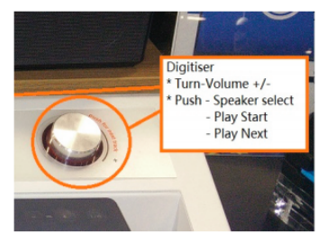
external Press and Turn button + external cable