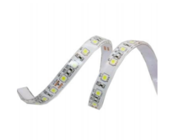
LED Light Strips