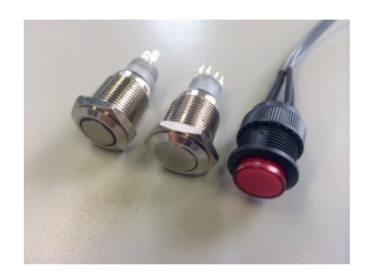
external press-buttons + external cable