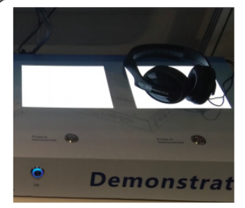
LED Light Pads