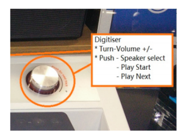
external Press and Turn button + external cable