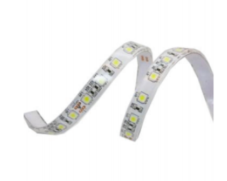
LED Light Strips