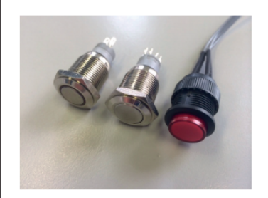
external press-buttons + external cable